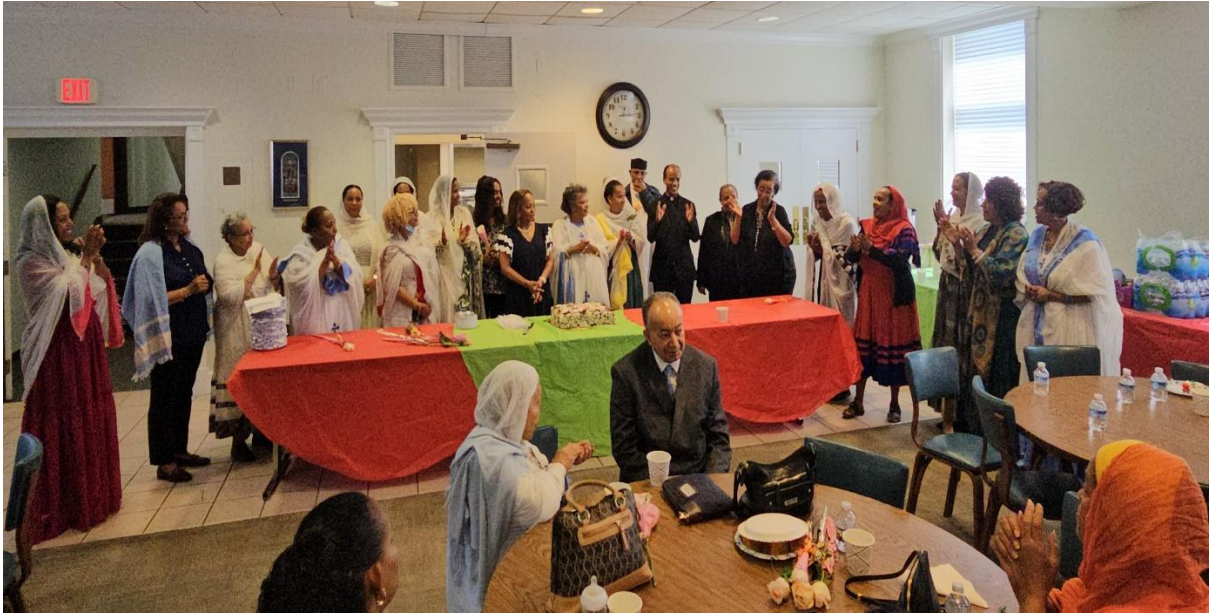
Confirmation June 2025