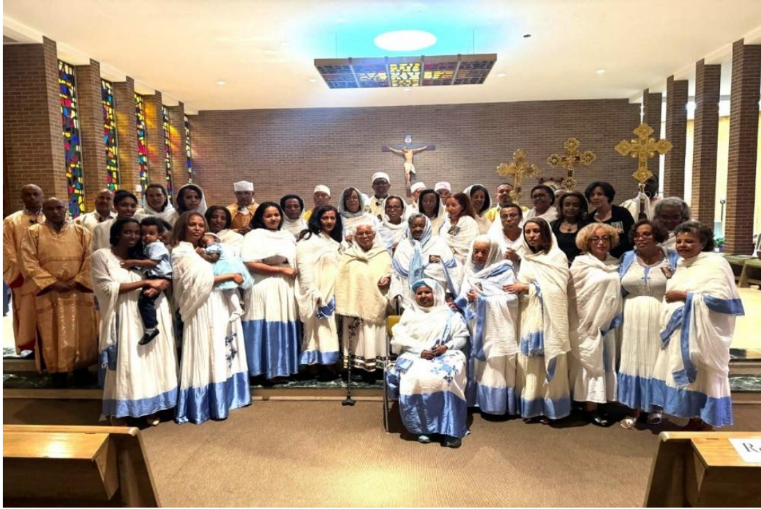
The annual feast of St. Anthony(June 15,2025)