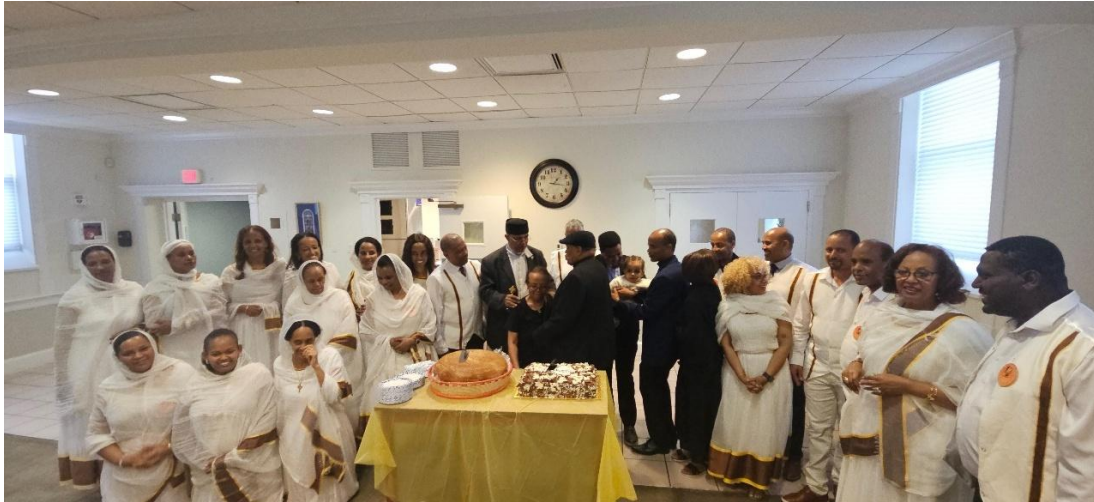
Annual Feast of the Sacred Heart of Jesus(June 29, 2025)