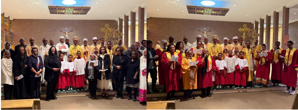
Abune Tesfasselassie Visit June 1, 2025